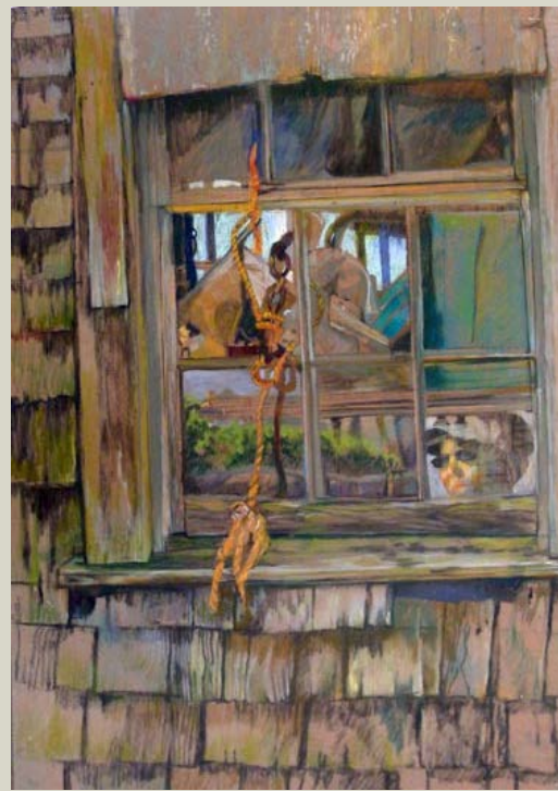
Wendy Shalen, "Menemsha Reflections, Self-Portrait," 2011, pastel on paper, 28 x 17 in. Prince Street Gallery

This article was featured in Fine Art Today, a weekly e-newsletter from Fine Art Connoisseur magazine.