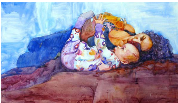
Wendy Shalen, "Sam Reading to Mia," 2013, watercolor on paper, 13 x 22 in. Prince Street Gallery