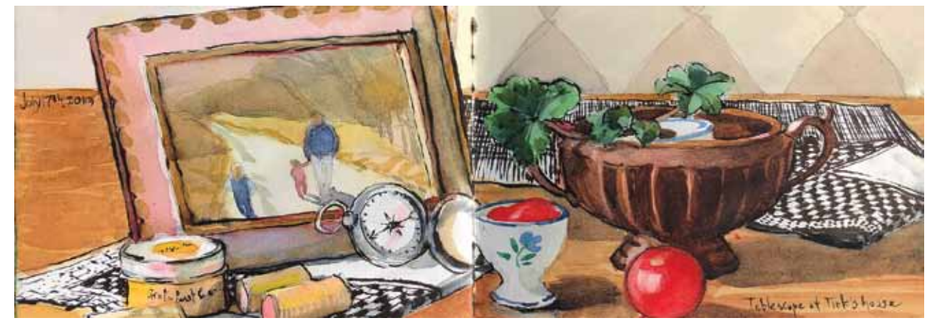
Tablescape at Tink's House (watercolor on paper, 5½x15)