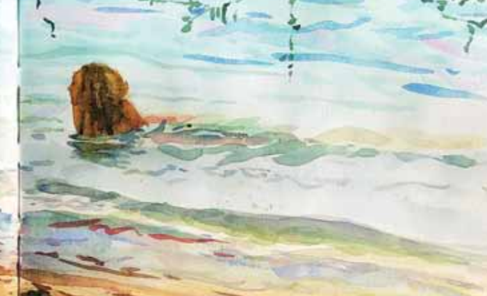
Mermaids, Hawaii (watercolor on paper, 7x20; 8x10 closed book size)