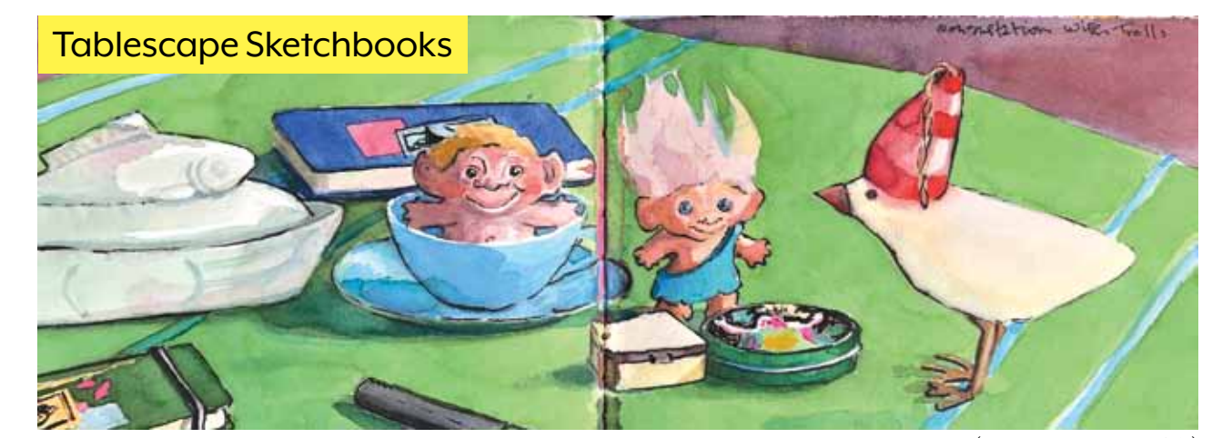
Trolls (watercolor on paper, 5½x15)

Nach nices the people and . Took a wonderful walk through forest that reminded me of Tondra. Very soppy soil with timy forwars