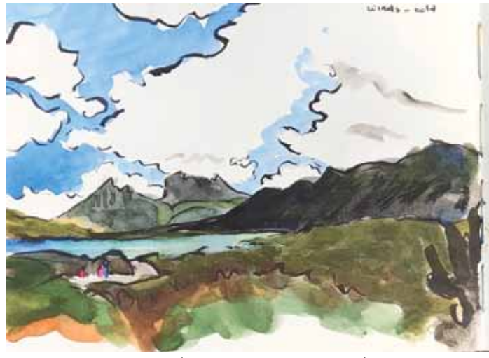
Cradle Mountain, Australia (watercolor on paper, 5x7 each)