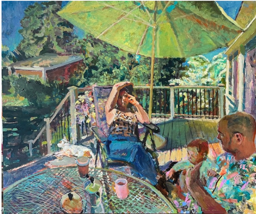
Grant Drumheller, Morning Coffee , 2023 Acrylic on canvas, 60 x 72 inches