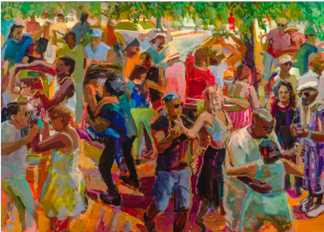
Grant Drumheller, Street Salsa , 2023 Acrylic on canvas, 60 x 84 inches

OPENING RECEPTION: THURSDAY, OCTOBER 3, 5 - 8pm HOURS: TUESDAY - SATURDAY, 11-6