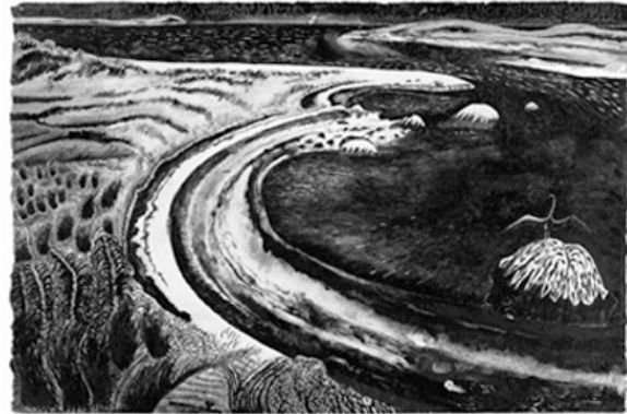
The "Gentleman" Leaves for Africa (Robinsons Hole) 1996