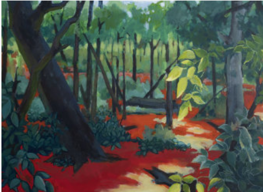
Lance Paull, Into the Forest Acrylic on panel, 36" x 48"

Continue scrolling to see additional images: