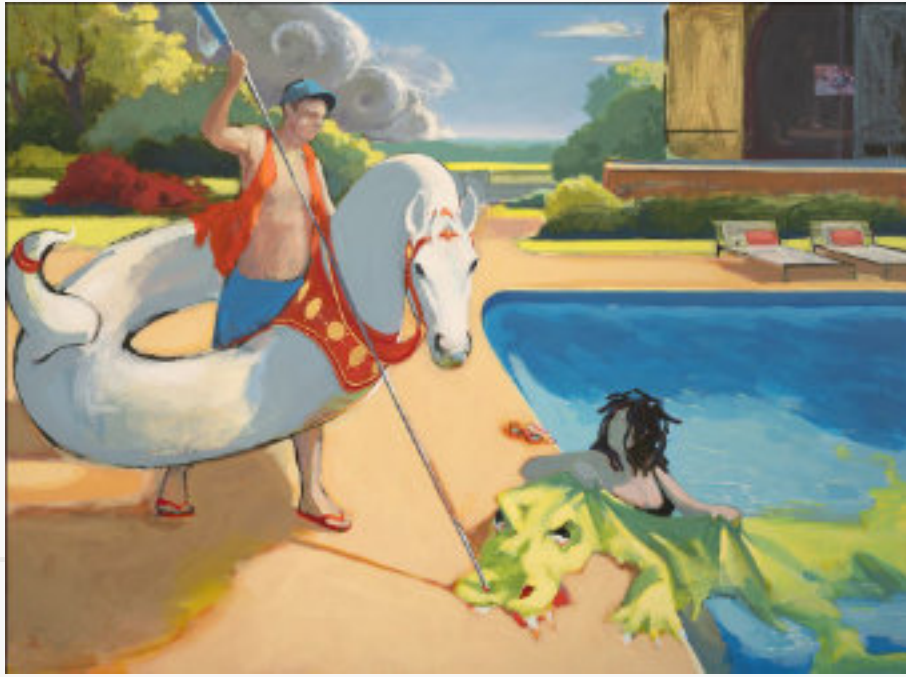
Lance Paull, Deflated , 2025 Acrylic on panel, 36" x 48"