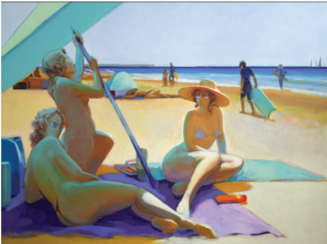
Lance Paull, Ocean Nymphs , 2025