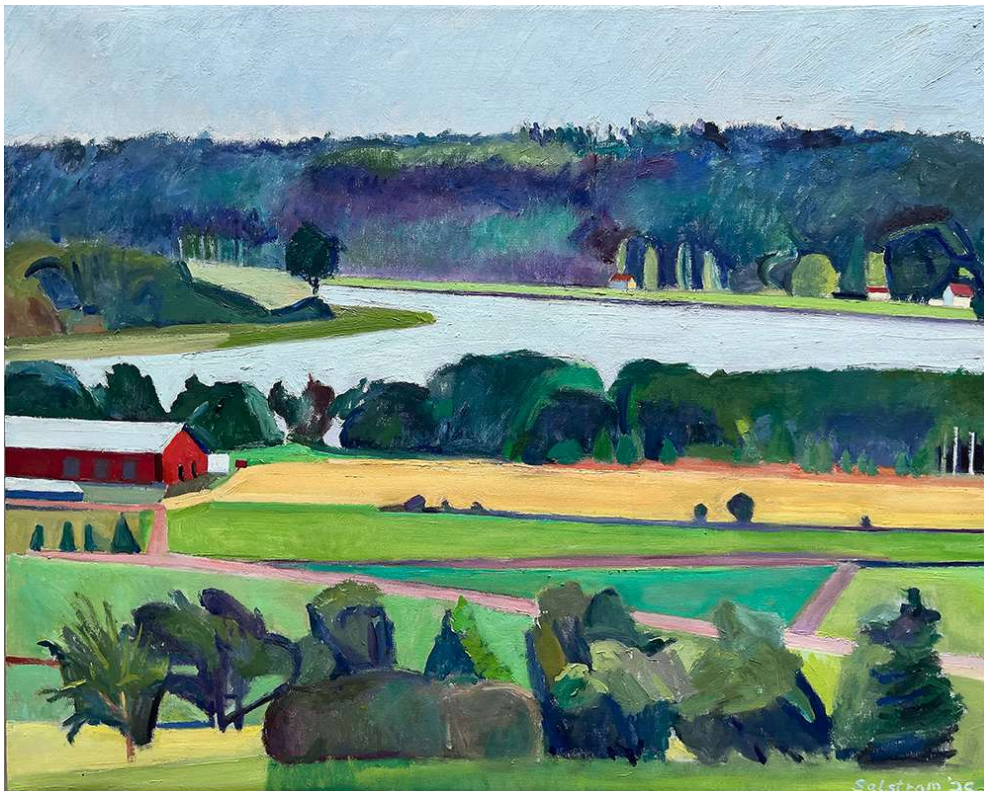
Mary Salstrom, View Above Lake Säbysjön, Tranås, Sweden, 2026, oil on canvas, 24" x 30"

GALLERY HOURS: TUESDAYS to SATURDAYS, 11 am - 6 pm